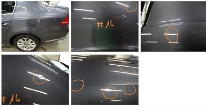
Roof pillar L, Hail damage, PDR - Hail 150,00