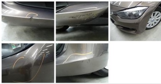
Bumper R, Bump(s) and scratch(es), LI - Repair and paint (complete) 211,80