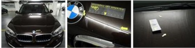
Engine, Damaged, Diagnosis 0,00