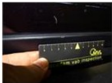
Windscreen, Broken, E - Replace 0,00