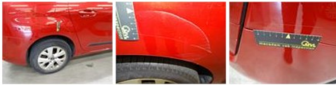
Wing F R, Bump(s) and scratch(es), LI - Repair and paint (complete) 220,18