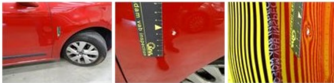
Front bumper, Scratch(es), LI - Repair and paint (complete) 211,80