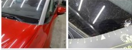
Wing R R, Scratch(es), LI - Repair and paint (complete) 0,00