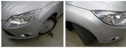
Bonnet, Bad repair, Acceptable 0,00