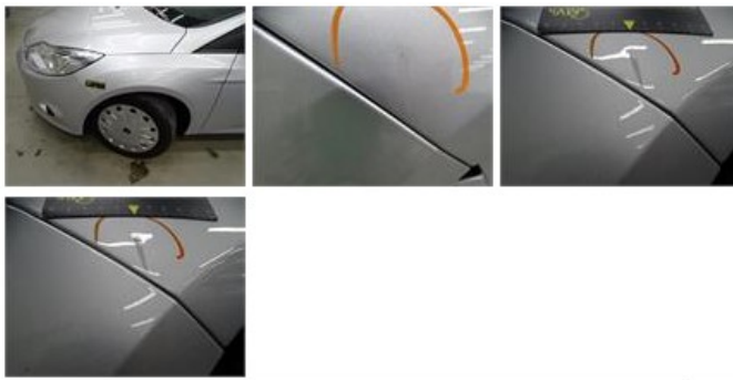
Door R L, Bump(s) and scratch(es), LI - Repair and paint (complete) 318,35