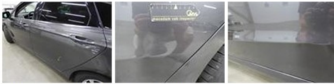
Bumper R, Bump(s), LI - Repair and paint (complete) 211,80