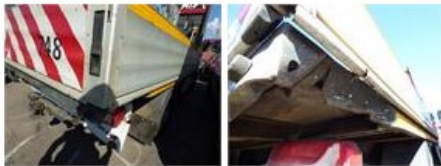
Wing F L, Bump(s), LI - Repair and paint (complete) 165,13