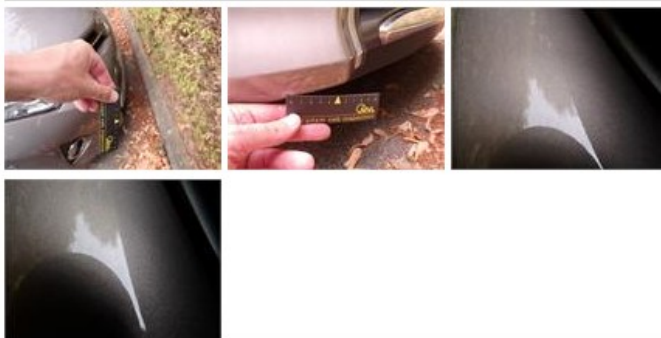
Roof, Bump(s), PDR - Knock out without painting 63,00