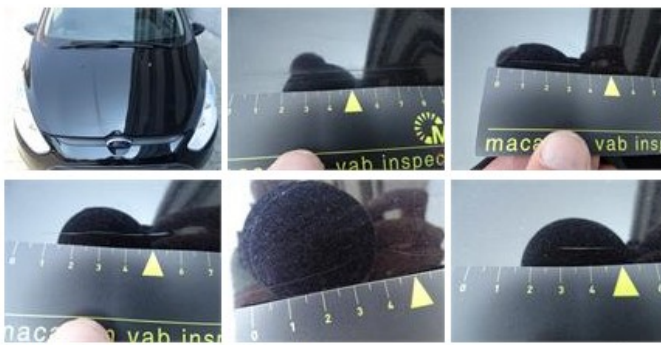
Tailgate, Accident, Le - Replace and paint 846,92