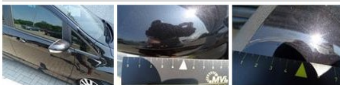
Rearview mirror housing R, Scratch(es), LI - Repair and paint (complete) 115,56