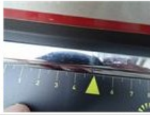
Wheel cover F R, Damaged, E - Replace