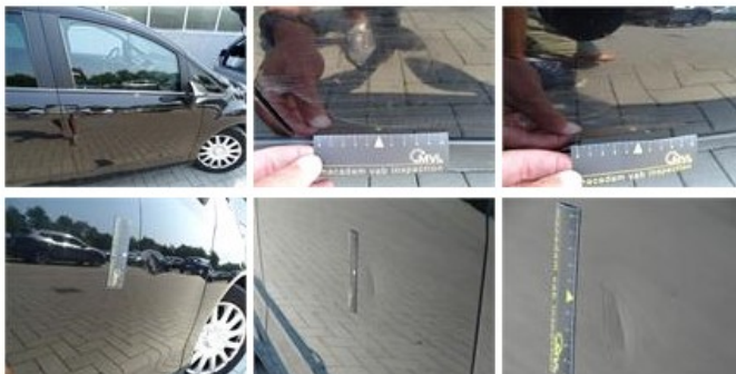
Door R R, Scratch(es), LI - Repair and paint (complete) 254,68