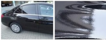
Alloy rim R L, Scratch(es), LI - Repair and paint (complete) 95,00