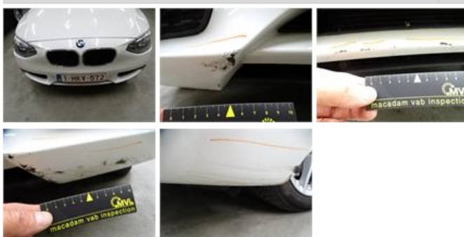
Bumper R, Bump(s) and scratch(es), LI - Repair and paint (complete) 211,80