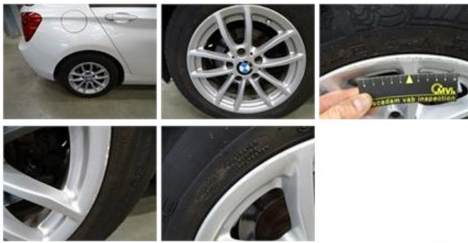
Alloy rim F R, Damaged, LI - Repair and paint (complete) 95,00