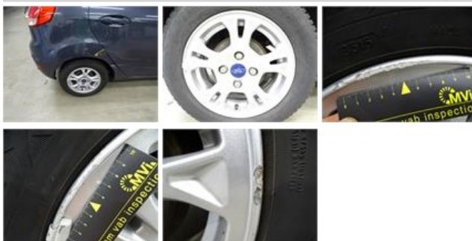
Wing F R, Bump(s) and scratch(es), LI - Repair and paint (complete)