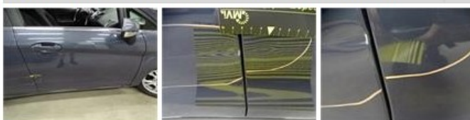
Door R R, Bump(s) and scratch(es), Le - Replace and paint 786,33