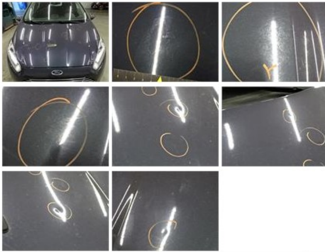
Wing R R, Bump(s) and scratch(es), Le - Replace and paint 1033,21