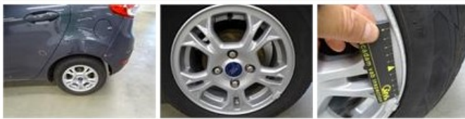
Alloy rim R L, Scratch(es), LI - Repair and paint (complete) 95,00