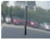
Bumper R, Scratch(es), LI - Repair and paint (complete)