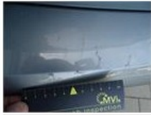
Engine protective plate, Hole, E - Replace