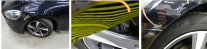
Wing F L, Bump(s), PDR - Knock out without painting 63,00