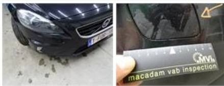
Alloy rim F R polished, Scratch(es), LI - Repair and paint (complete) 95,00