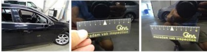
Bonnet, Chemical pollution, LI - Repair and paint (complete) 290,08