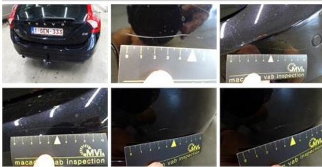
Wing R R, Scratch(es), LI - Repair and paint (complete) 308,20