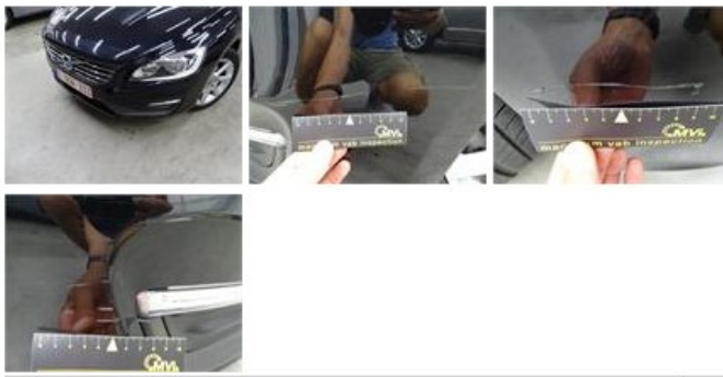
Door F R, Scratch(es), LI - Repair and paint (complete) 318,35