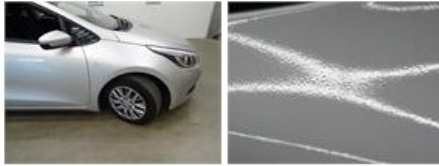
Bonnet, Dent(s), PDR - Knock out without painting 63,00