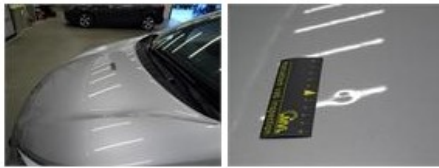
Wing R R, Bad repair, Acceptable 0,00