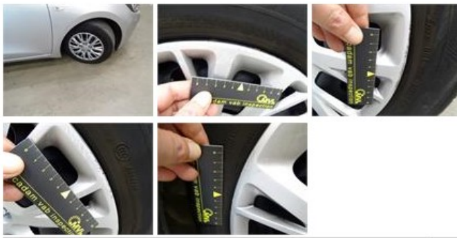
Wing F R, Bad repair, Acceptable 0,00