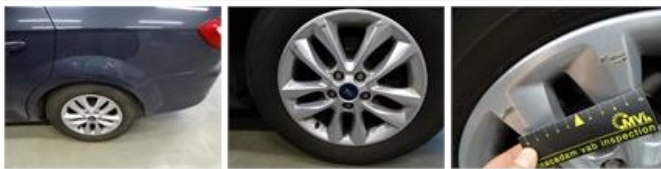
Alloy rim R L, Scratch(es), LI - Repair and paint (complete) 95,00