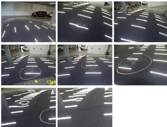
Bonnet, Chemical polution, LI - Repair and paint (complete)