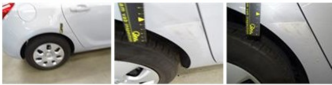
Outer door handle R R, Scratch(es), LI - Repair and paint (complete)