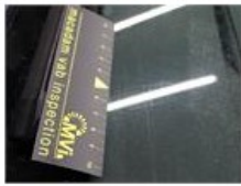
Bumper R, Scratch(es), LI - Repair and paint (complete)