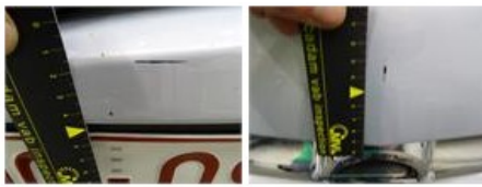
Rear window, Scratch(es), E - Replace