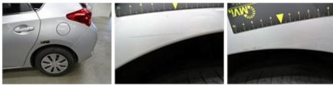
Door R R, Scratch(es), LI - Repair and paint (complete) 318,35