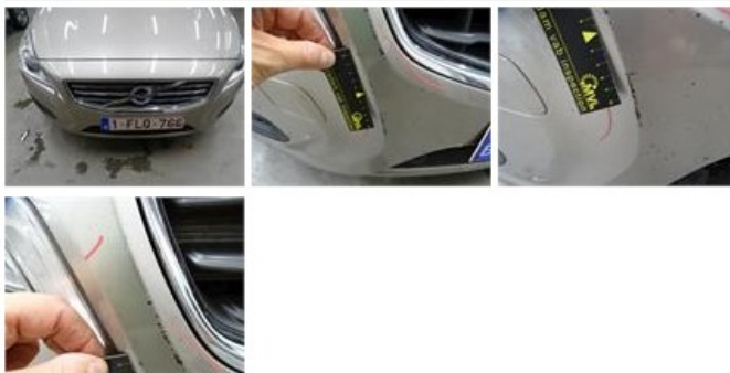
Bumper R, Scratch(es), Acceptable 0,00