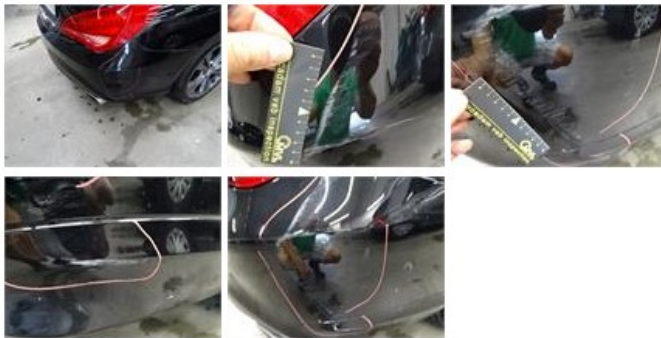
Front bumper, Scratch(es), LI - Repair and paint (complete) 211,80