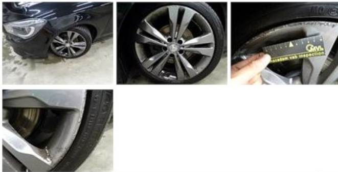
Alloy rim R R, Scratch(es), LI - Repair and paint (complete) 95,00