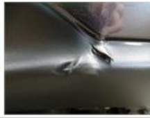
Door F R, Scratch(es), LI - Repair and paint (complete)