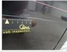
Door F L, Dent(s) and scratch(es), LI - Repair and paint (complete)