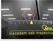
Bumper R, Crack, Le - Replace and paint