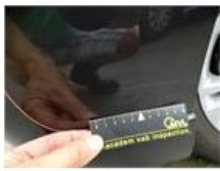
Bumper R, Dent(s), Smart repair