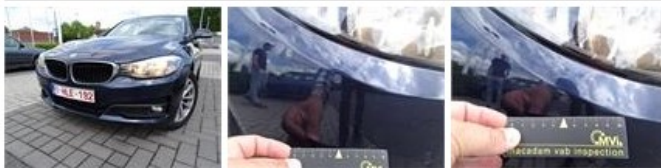
Bumper R, Dent(s) and scratch(es), LI - Repair and paint (complete) 211,80