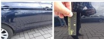
Door R L, Scratch(es), Acceptable 0,00