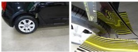
Front bumper, Deformed / Strained, Le - Replace and paint