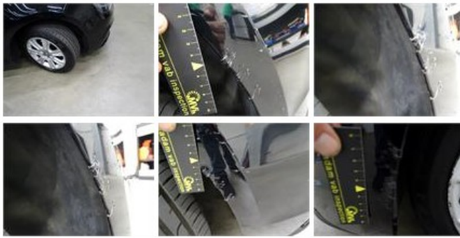
Door F R, Dent(s) and scratch(es), LI - Repair and paint (complete)