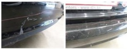
Front bumper, Dent(s) and scratch(es), LI - Repair and paint (complete) 259,80