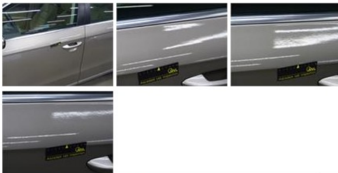
Door panel F L, Worn, Acceptable 0,00