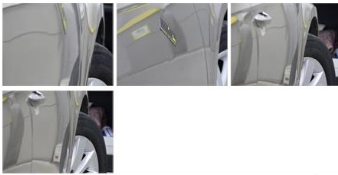
Bonnet, Dent(s), PDR - Knock out without painting 82,80