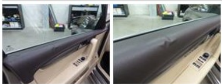
Door R L, Repaired, Acceptable 0,00