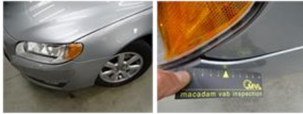
Alloy rim F R, Scratch(es), LI - Repair and paint (complete) 95,00