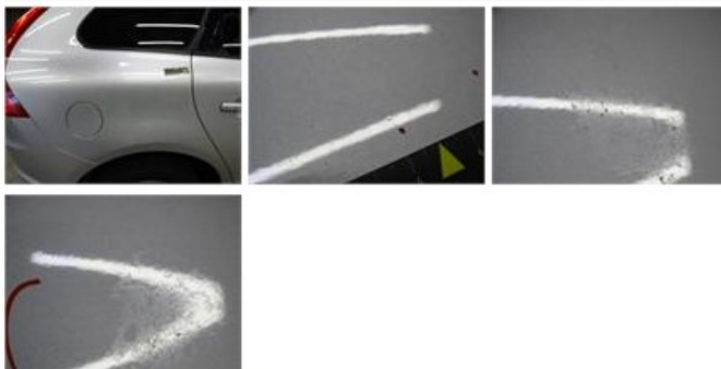
Bonnet, Hail damage, PDR - Hail 0,00