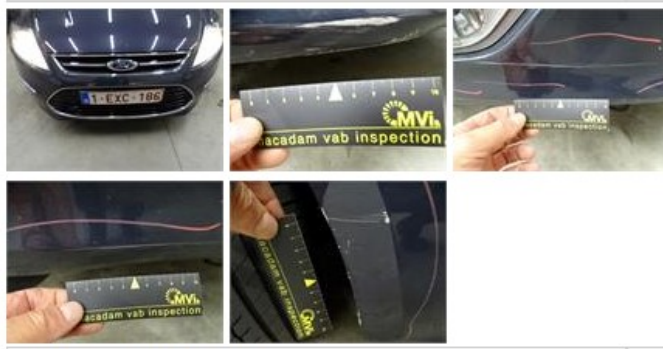
Bonnet, Stone chip(s), Acceptable 0,00