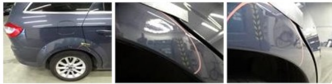
Alloy rim R R, Scratch(es), Acceptable 0,00