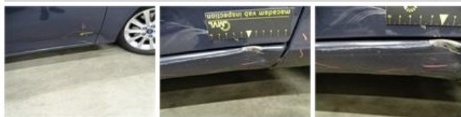
Door R R, Scratch(es), Acceptable 0,00