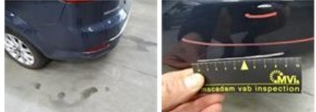
Front bumper, Scratch(es), LI - Repair and paint (complete) 211,80