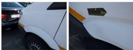
Rocker panel inner F L, Rust, LI - Repair and paint (complete) 115,56