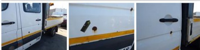
Sill outer R, Rust, LI - Repair and paint (complete) 232,88