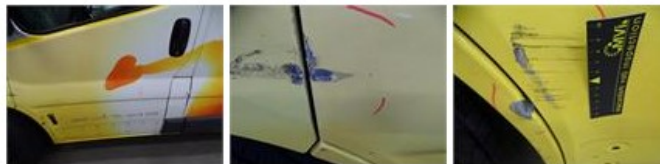
Wing F R, Deformed / Strained, Le - Replace and paint