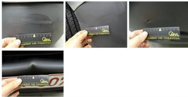
Door moulding Lower R R, Missing, E - Replace