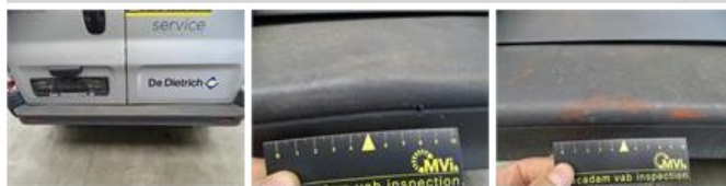
Bumper corner R L, Dent(s), Smart repair