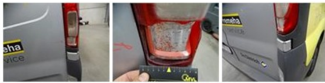
Rearlight L, Broken, E - Replace