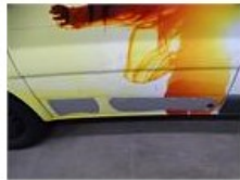
Wing F L, Dent(s) and scratch(es), LI - Repair and paint (complete)