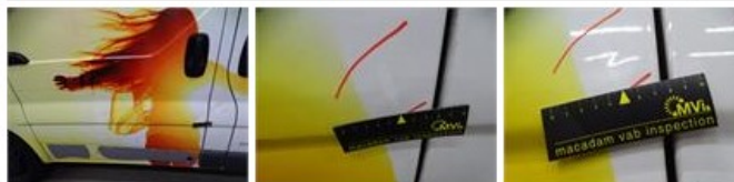
Door F L, Dent(s) and scratch(es), LI - Repair and paint (complete)