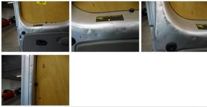
Door F R, Dent(s), PDR - Knock out without painting 63,00