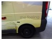
Trunk door panel R, Scratch(es), Smart repair