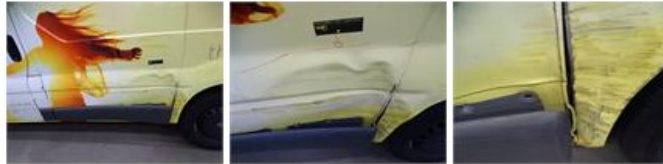
Door moulding Lower R L, Damaged, E - Replace