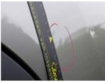
Door F L, Dent(s), PDR - Knock out without painting