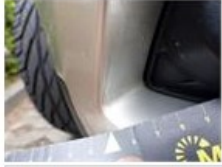
Alloy rim F L, Scratch(es), Acceptable