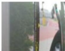
Step L, Scratch(es), Acceptable