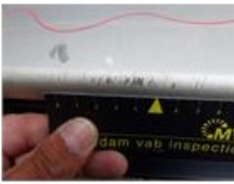
Bumper F R, Dent(s) and scratch(es), It - Spot repair