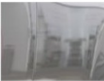
Door F R, Dent(s), Acceptable