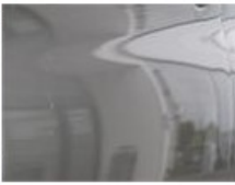
Door R R, Dent(s), Acceptable