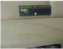
Door R L, Repaired, P - Check