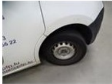
Wing R L, Dent(s) and scratch(es), LI - Repair and paint (complete) 231,15