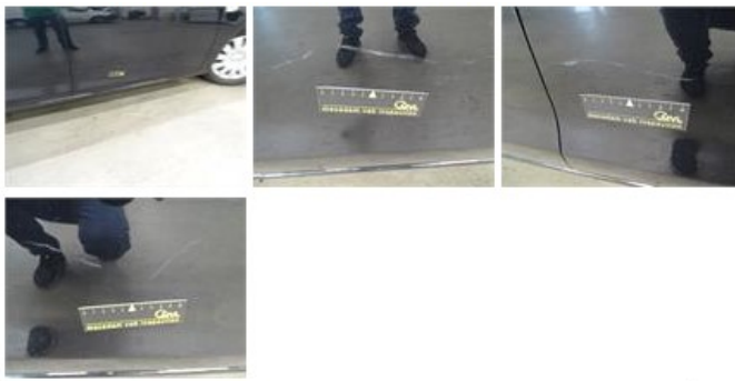
Door R R, Scratch(es), LI - Repair and paint (complete) 318,35