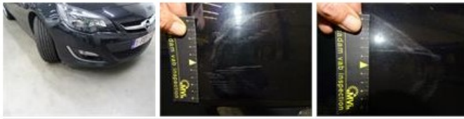
Bumper R, Scratch(es), It - Spot repair 115,56