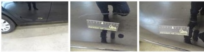
Front bumper, Scratch(es), LI - Repair and paint (complete) 211,80