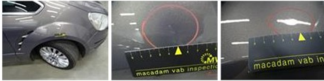
Front bumper, Scratch(es), It - Spot repair 115,56