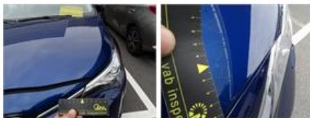
Wing R R, Not original part, Acceptable