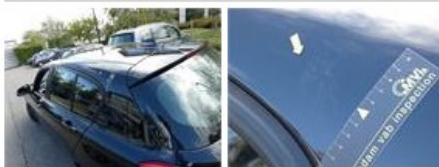
Roof, Chemical polution, LI - Repair and paint (complete) 481,50