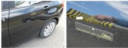
Door R R, Scratch(es), Acceptable 0,00