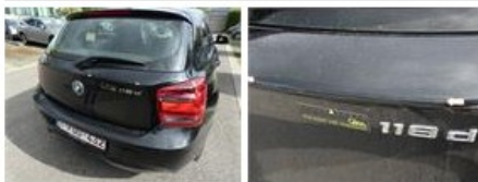
Roof pillar L, Chemical polution, LI - Repair and paint (complete) 220,18