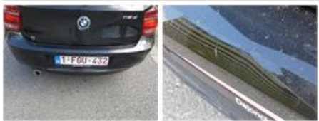
Wing F L, Dent(s) and scratch(es), LI - Repair and paint (complete) 268,18