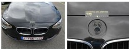
Bonnet, Chemical polution, LI - Repair and paint (complete) 290,08