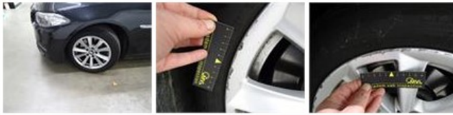
Alloy rim R R, Scratch(es), LI - Repair and paint (complete) 95,00