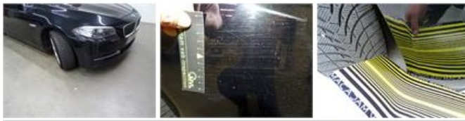
Alloy rim F L, Scratch(es), LI - Repair and paint (complete) 95,00