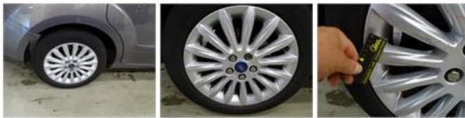
Alloy rim F L, Scratch(es), LI - Repair and paint (complete) 95,00