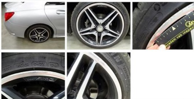
Alloy rim F L polished, Scratch(es), LI - Repair and paint (complete) 95,00