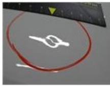
Alloy rim R L, Scratch(es), LI - Repair and paint (complete)