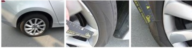
Alloy rim R R, Scratch(es), LI - Repair and paint (complete) 95,00