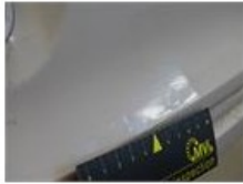
Bodywork, Not original part, Acceptable