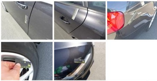
Wing F L, Dent(s) and scratch(es), Le - Replace and paint 530,02