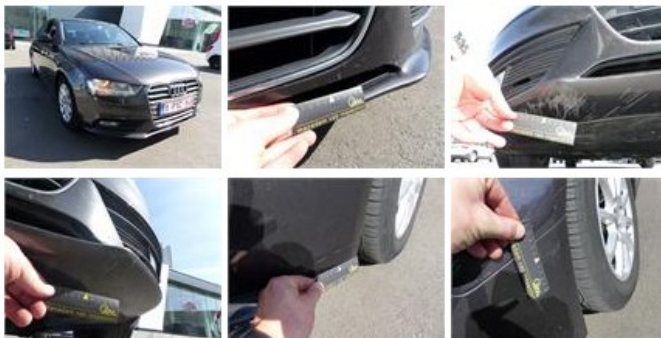
Bumper grille, Broken, E - Replace 32,40