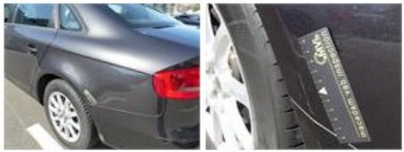
Bumper R, Scratch(es), LI - Repair and paint (complete) 259,80