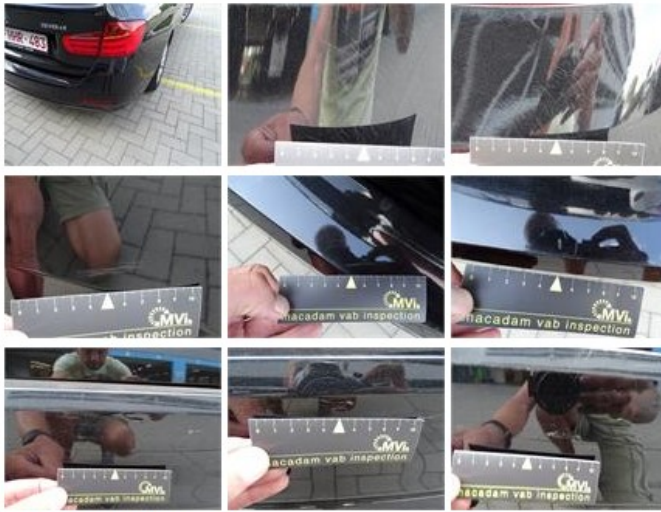
Wing R L, Dent(s), Acceptable