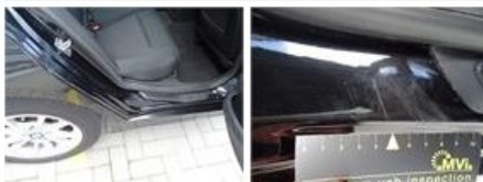
Door F L, Scratch(es), LI - Repair and paint (complete)