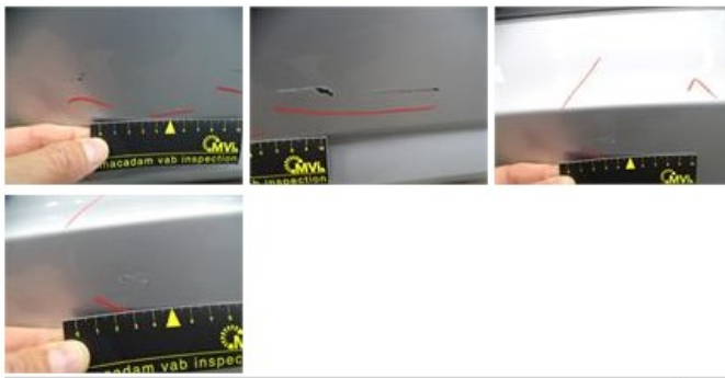
Protection plate M, Tear, E - Replace 74,00