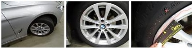
Bumper F, Scratch(es), LI - Repair and paint (complete) 211,80