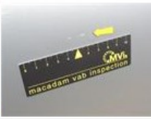
Ceiling, Burned, Smart repair