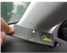
Door seal F R, Deformed / Strained, Acceptable