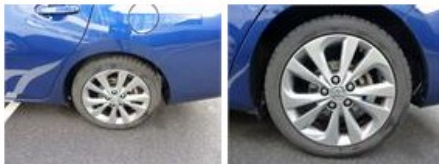
Alloy rim R R, Scratch(es), LI - Repair and paint (complete) 95,00