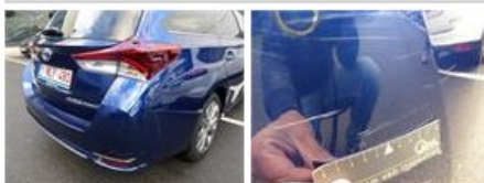
Door F R, Dent(s) and scratch(es), Acceptable 0,00