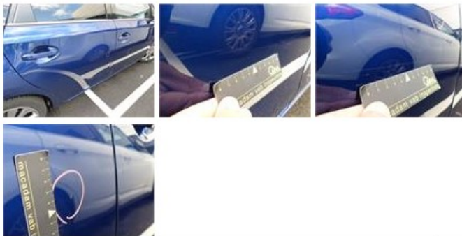
Bumper F R, Scratch(es), It - Spot repair 115,56