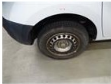
Wheel cover F R, Missing, E - Replace 22,50